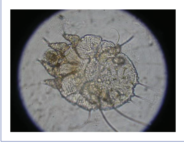
Figure 2. McCrossin I. Histological slide with haematoxylin and eosin staining showing a mite in the epidermis (photo) (2020).