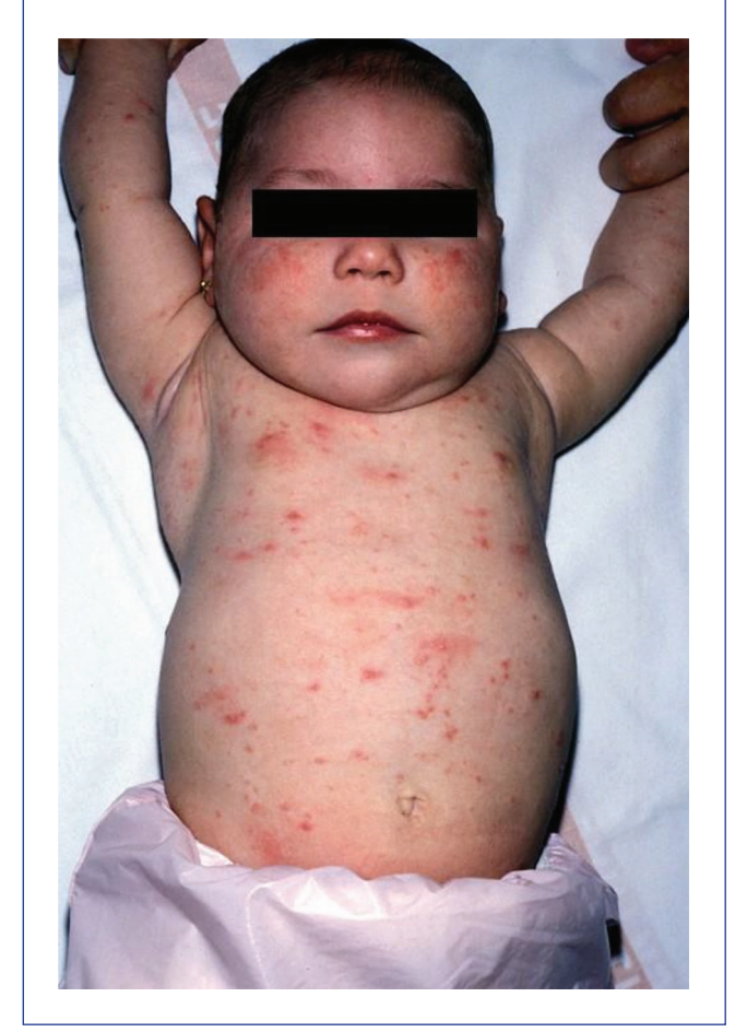
Figure 4. Wong L. Scabies affecting the axilla of a child (photo) (2020).